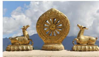
The Dharma wheel

The lotus flower - Even from a murky start, humans can achieve enlightenment.